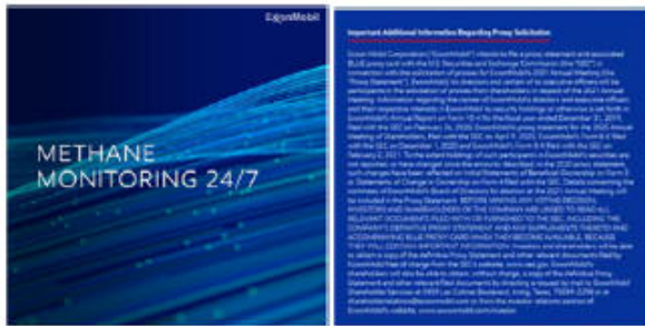
Methane Monitoring 24/7