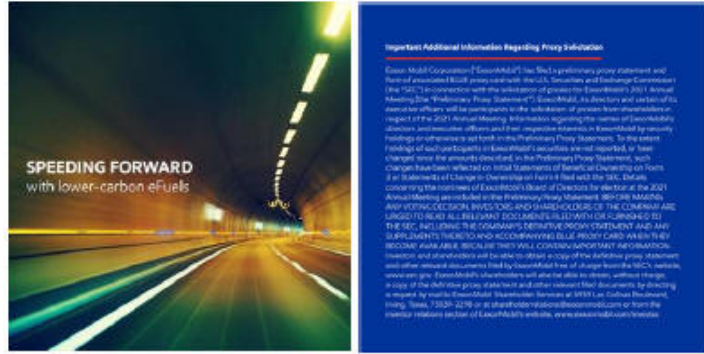
ART CARD SUPERS: SPEEDING FORWARD with lower-carbon eFuels Proxy legalese