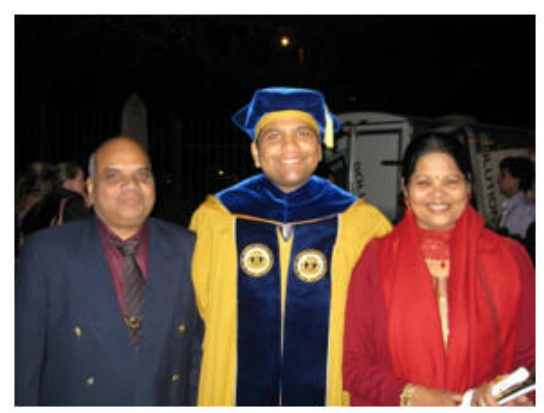
Caption: My parents and I at my PhD graduation ceremony at Georgia Tech in 2010. This is particularly poignant because my father is also a chemical engineer, and he encouraged me to pursue graduate studies.

Of course, today's energy challenges are far from what my father could have imagined. We are in the midst of a major transition, exchanging carbon-intensive fuels like coal for a lower-carbon mix of renewables and natural gas. As a young scientist, I take this transition very seriously. It's what keeps me up at night, and is why I got my PhD in chemical engineering from Georgia Tech.