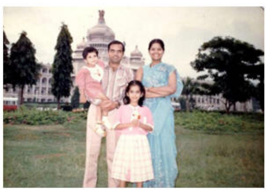
Caption: My family and I visiting Vidhana Soudha, the state legislature building in Bangalore.

Access to safe, reliable energy is critical to societal and economic development. That was something my father understood, and a lesson he passed on to me. As a 35-year-old researcher at ExxonMobil, I'm working on projects that couldn't have existed during his career, but I still prioritize that same goal of improving energy security.