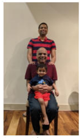
Caption: A happy moment early 2020 celebrating my father's birthday in Houston. My father holds my younger son and I stand behind him - three generations.