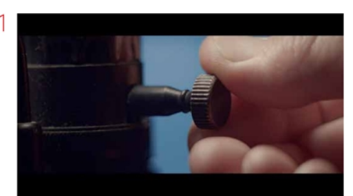
INTRO INTRO MUSIC PLAYS