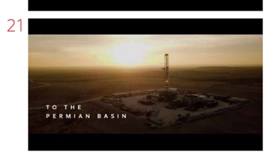
vo to the U.S. Permian Basin