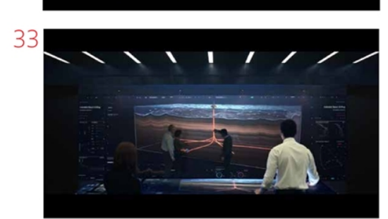
vo Every day,