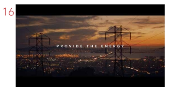
vo to provide the energy