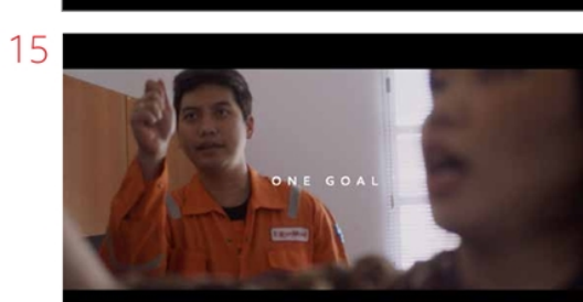
vo one goal: