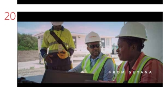
vo from Guyana