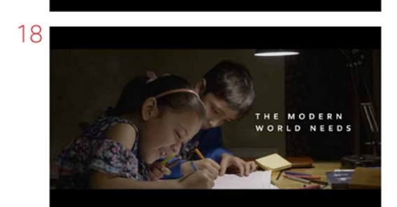
vo the modern world needs.