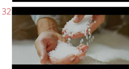
vo and advanced polymers.