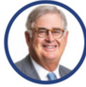
Samuel J. Palmisano Former Chairman of the Board, President & CEO, IBM