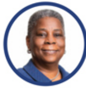
Ursula M. Burns Former Chairman of the Board & CEO, VEON, Ltd.