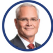
Darren W. Woods Chairman of the Board & CEO, Exxon Mobil Corporation