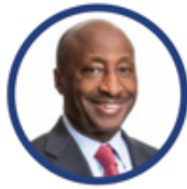
Kenneth C. Frazier Chairman of the Board & CEO, Merck & Co.