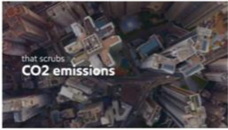
SUPER that scrubs CO2 emissions