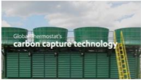
SUPER Global Thermostat's carbon capture technology